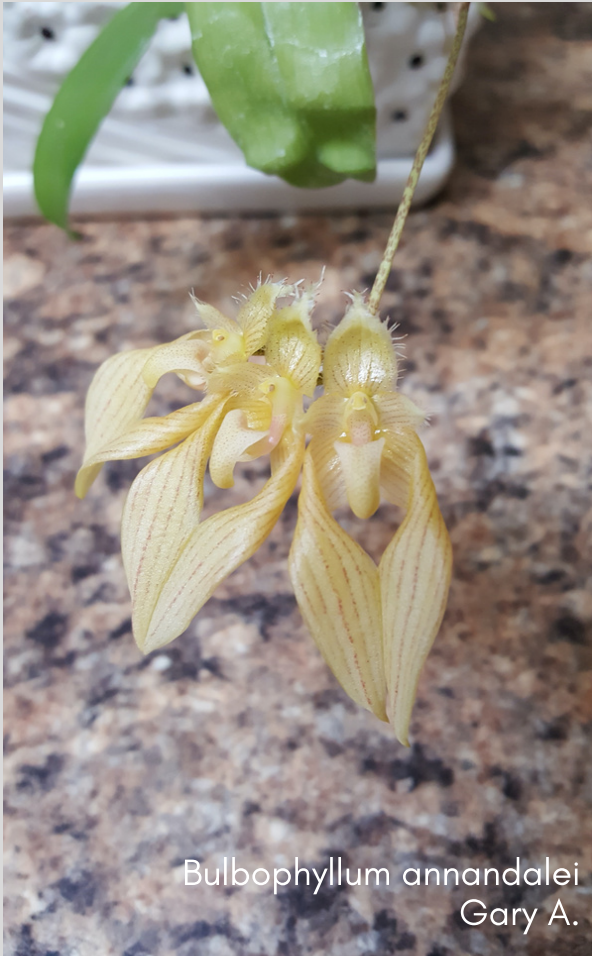
Bulbophyllum annandalei