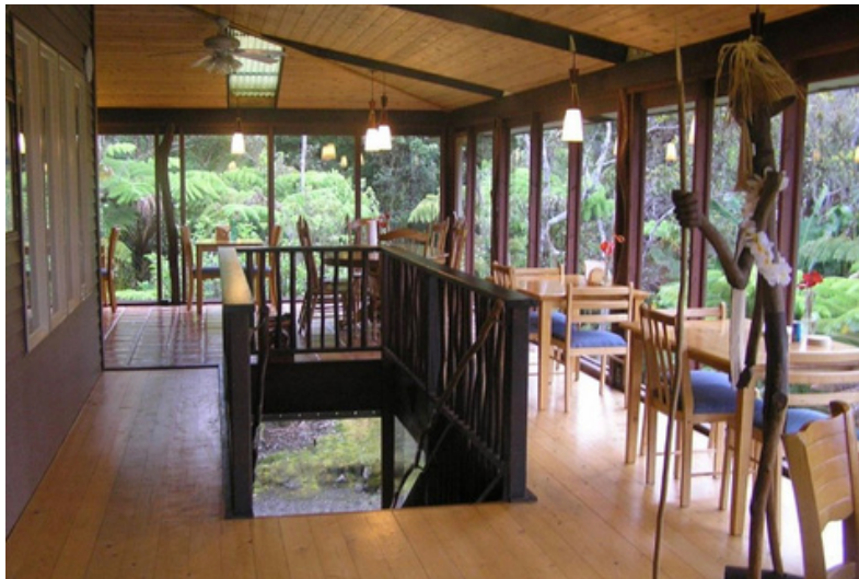
Volcano Room View from our room

Back in 2012, Ida and I had booked a well-deserved long vacation to Kona on the big Island of Hawai'i. The first week was just unbearably hot, even the locals were complaining. In desperation for some relief, I was able to book us a room for a couple of nights at the Volcano Inn in Volcano Village near the Kilauea Volcano. Volcano Village is a quaint little town located at 4000' ASL (above sea level) in a rain forest; the cooler weather up there was such a pleasant change from the searing heat of Kona.