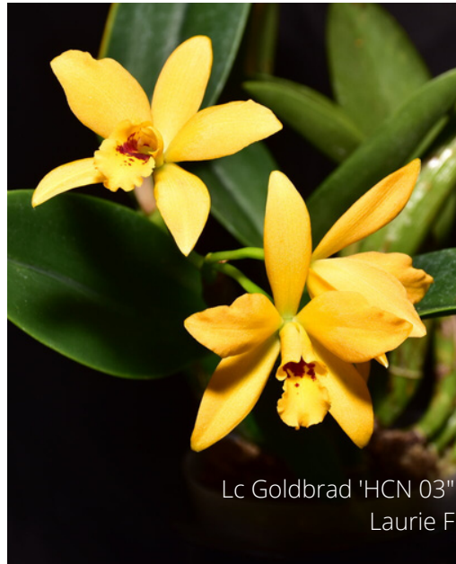
Lc Goldbrad 'HCN 03" Laurie F