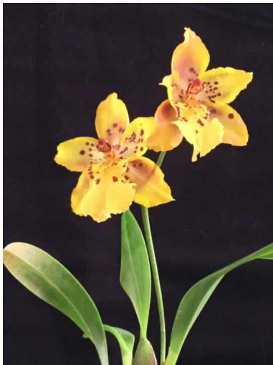
Odontocidium Tiger Crow 'Golden Girl' ( Odcdm Tiger Hambuhren x Odcdm Crowborough )