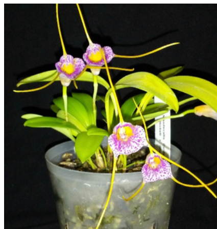
Masdevallia Confetti ( Masdevallia strobilii x glandulosa )