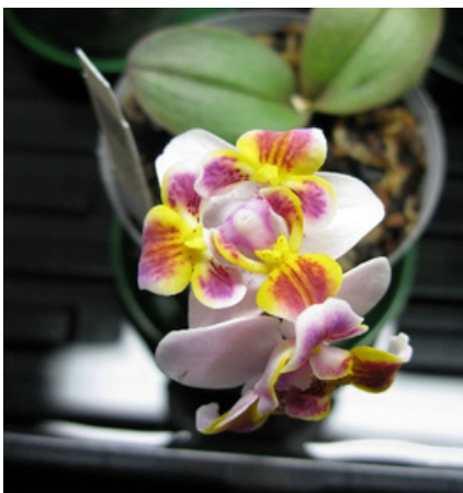
Phalaenopsis be Glad 'Peloric' (Phal Swiss Miss x Phal Cassandra)