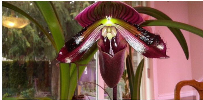
Paphiopedilum Yi-Ying Morning Sun (Hsinying Rainbow x Red Czar)