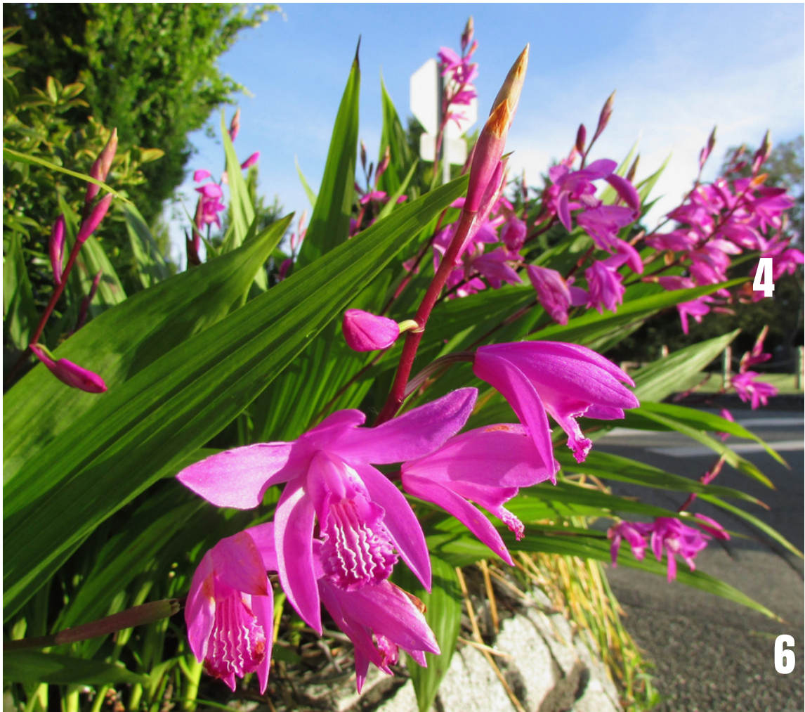
Bletilla striata in Comox – Shaun W.