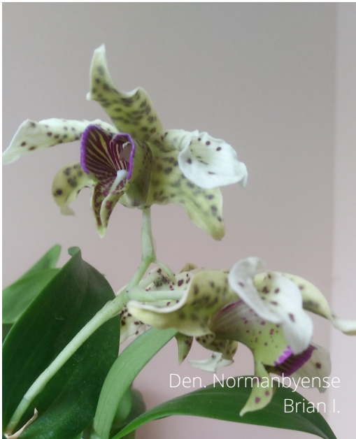
Den. Normanbyense Brian I.