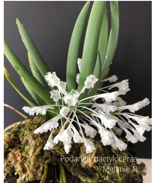
Podangis dactyloceras Melanie N.