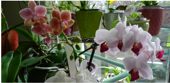
Sheila's Phal Display