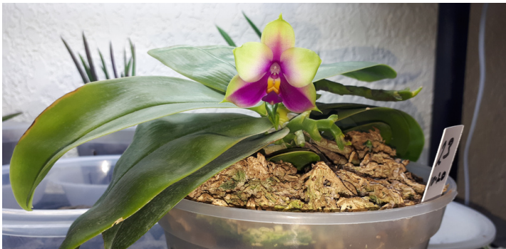
Phal. bellina f. coerulea x Kung's Red Cherry