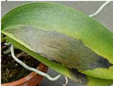
Bacterial rot on Phalaenopsis leaf.

In areas with dry summers, mites can be a serious problem especially on phalaenopsis. These creatures attack the surface of the leaves producing a sort of rough, silvery appearance. Mites are not insects and insecticides offer little or no control. Mites do not like humid conditions so efforts to increase humidity are beneficial. Light infestations can be controlled by thoroughly cleaning plants but in hot, dry climates light infestations rapidly become serious and control is best accomplished by the use of a miticide.