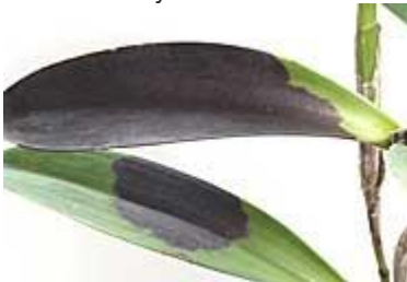
Black rot, a fungal disease on Cattleya leaves.

Wet foliage and high humidity encourages the spread of fungal and bacterial diseases. Bacterial diseases do not respond to fungicides and vice versa so it's very important to know which disease you are dealing with. Perhaps the easiest way to distinguish between the two is by smell. The most common bacterial disease in orchids produces a foul smell often likened to dead fish. If you've ever had cut flowers stand too long in water you know the sort of smell we're talking about.