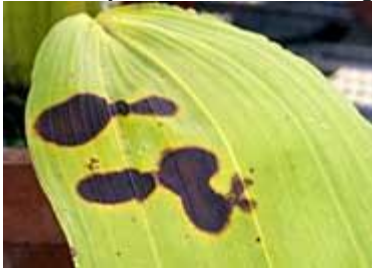
Sunburn on a Bifrenaria leaf.

Solar radiation is much more intense in the summer and plants that have been happily in full sun all winter may need a little extra protection (shade) when the sun is the strongest or, often during the late afternoon when the temperatures are highest. Orchids are easily sunburned and you should take care when moving plants around, especially if you are moving plants grown inside during the winter to a spot outside for the summer. Sunburn, while not in itself a serious problem is irreversible and will make your plants look ugly. In serious cases the plant can be killed outright and any leaf damage is an invitation to a secondary infection in the damaged area.