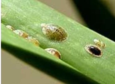
Soft brown scale

Summer presents challenges in the form of increased pest activity, fungal and bacterial problems in traditionally wet areas and desiccation in those areas with Mediterranean-like climates where summers are typically quite dry. Observation is the watchword for the summer months. Careful observation of your plants is the best way to identify small problems before they become big problems and in the summer, the time between these two events is dramatically shorter due to higher temperatures --- the earlier you catch a problem, the easier it is to control.