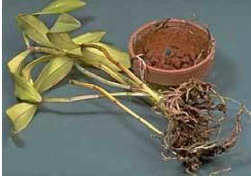
A desiccated Cattleya note lack of live roots.

Orchids in dry summer areas dry out much more rapidly than they did in the winter. Depending on temperature, plants watered every two weeks in the winter may need to be watered every few days in the summer. Here again, nothing will take the place of careful observation. If you have an extensive collection of plants, you might want to consider installing a misting system similar to those used in open-air restaurants in dry areas. Low pressure units that install on hose lines are inexpensive and work reasonably well to raise humidity as well as cool the growing area somewhat.