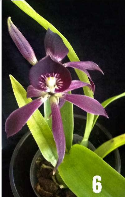
6. Guarechea Black Comet - Shirley M.