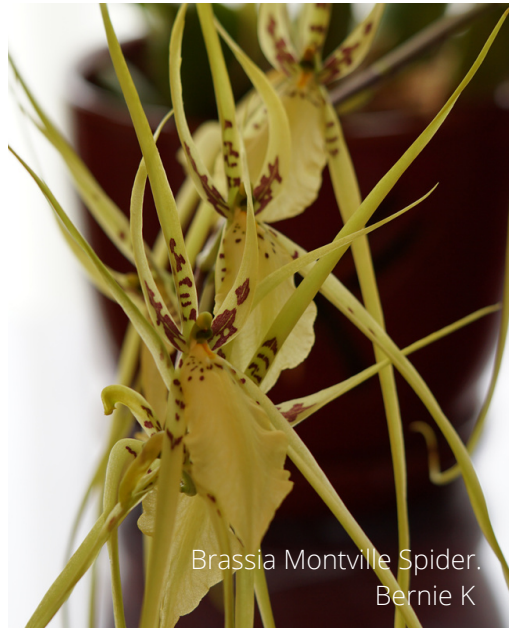
Brassia Montville Spider.