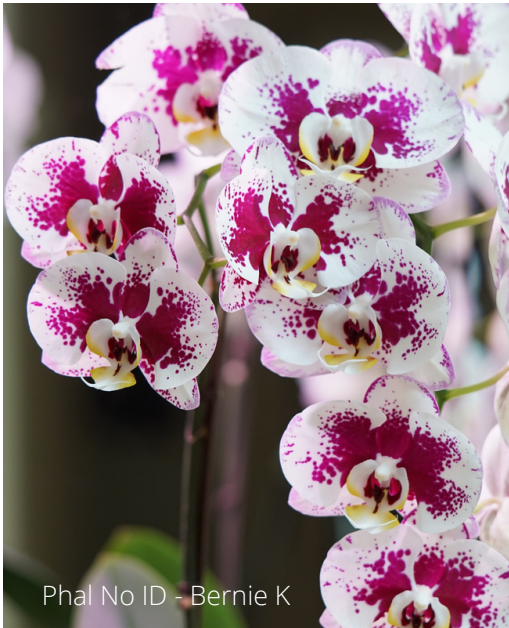
Phal No ID - Bernie K