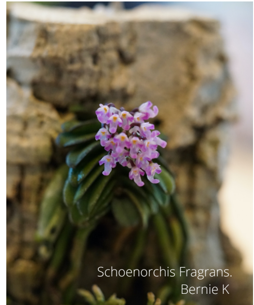
Schoenorchis Fragrans.