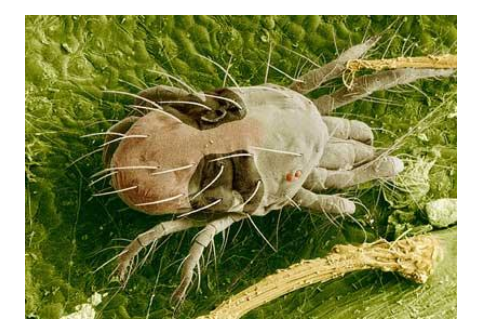
Two Spotted Mite