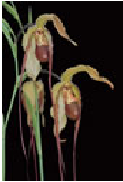
Phragmipedium Grande 'Suzanne' AM/AOS