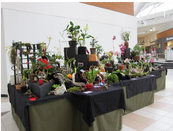
CVIOS display table